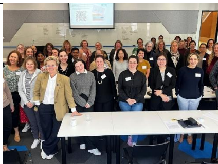
Clinical Trials at Barwon Health